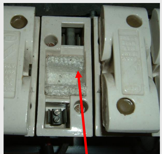
Arctic Fuse (Asbestos Flash pad)