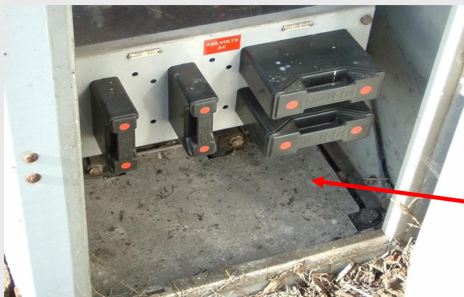
Asbestos Base Board